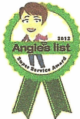
Super Service Award