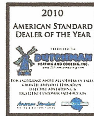
Dealer of the Year