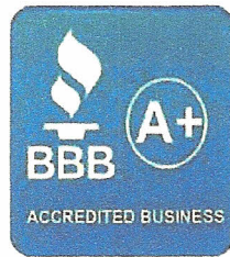
Complaint Free 2007 - 2013