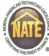
Equivalent to a Master's Degree in our field